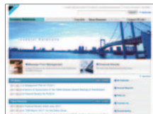
Shareholder and Investor Information website