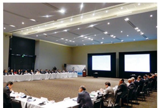
Air Conditioner Forum in Latin America

Besides our participation so far in international conferences of groups such as the Japan Refrigeration and Air Conditioning Industry Association (JRAIA) and the American Society of Heating, Refrigerating and Air-Conditioning Engineers (ASHRAE), we took part in the International Sorption Heat Pump Conference (ISHPC 2017) in August 2017 in Tokyo, and we will take part in the 9th Asian Conference on Refrigeration and Air-conditioning (ACRA 2018) in June 2018 in Sapporo.