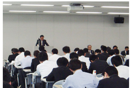
End-of-year financial performance briefing for analysts and institutional investors

For analysts and institutional investors, we hold interim and end-of-year financial performance briefings, and conference calls every first and third financial quarter. In addition, we visit and hold talks with institutional investors in Japan and other countries. We speak with investors on nearly 350 occasions through business briefings, factory tours, and face-to-face meetings.