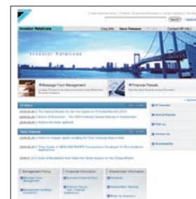
IR website for investors

The opinions from shareholders and investors are reflected in our management.