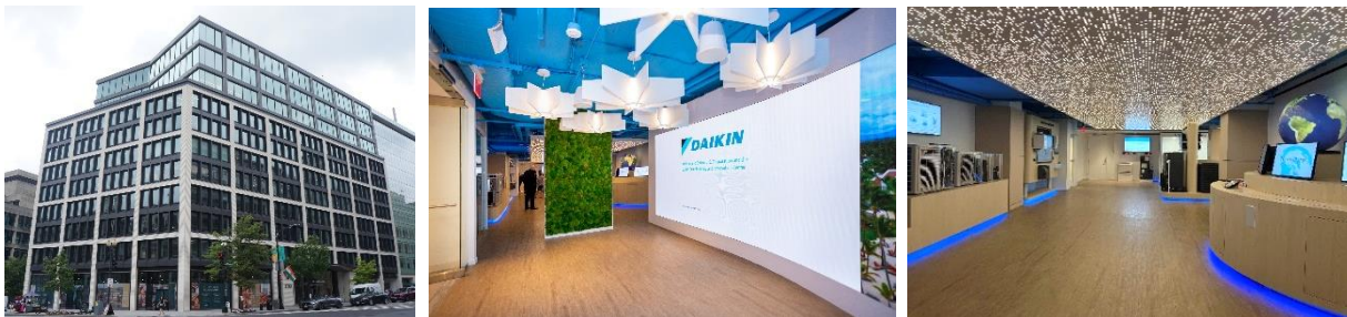
Images of the Daikin Sustainability & Innovation Center

As a global leading HVAC company, Daikin will take the initiative to work with various stakeholders to promote environmental technologies and contribute to the realization of carbon neutrality in the United States.