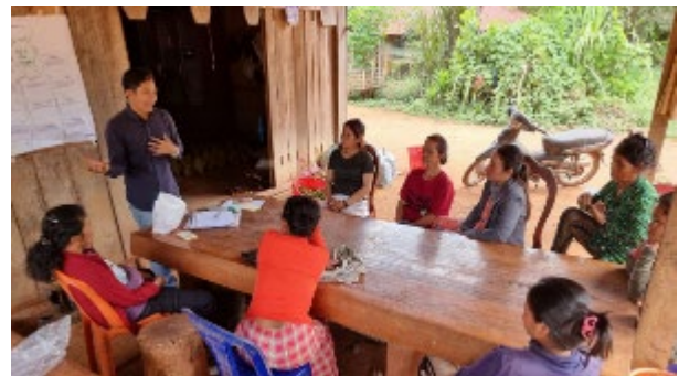
Coaching to lemongrass essential oil enterprise in Tatey Leu

With support from the project, the lemongrass oil producers group was able to raise the price of their oil from US $120 per litre to US $150 per litre this year after negotiating with brokers.