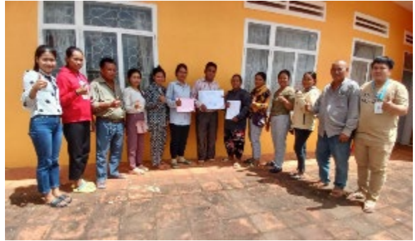
Bookkeeping training to Saving Group on 19-20 June 2024

the Sustainable Livelihood team successfully recruited Saving Committees. By report period, four saving groups were established, with a total of 71 members (50 female, 21 male) in Mongri and Tropoung Pong sub-villages. The groups' by-laws were developed and approved by local authorities at the village and commune levels, ensuring recognition and support. Each group was also received material support from the project to operate the saving model.