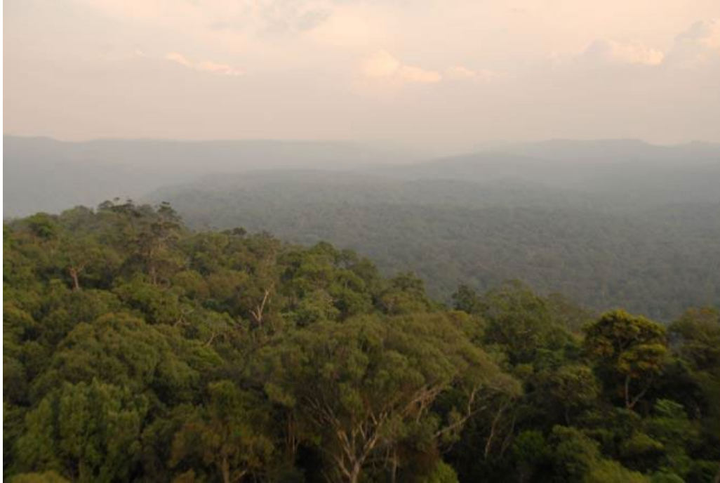
The Cardamom Mountains.