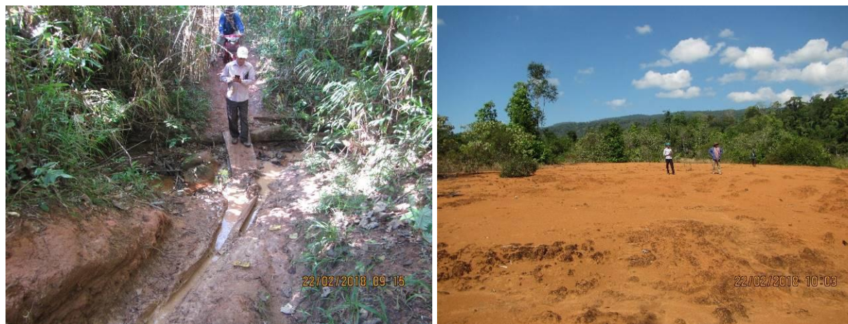
Discussion meeting and site visit on livelihood and ecotourism improvement in Tatay Leu commune, participated in by MoE's technical officers, Koh Kong-PDoE, a Tatay Leu commune leader, and the community