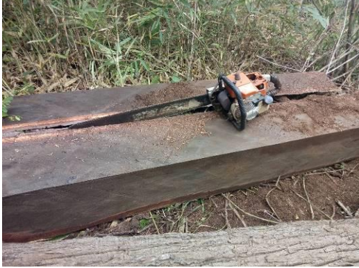
The PA law was explained to illegal loggers before they were given a written warning and their chainsaws confiscated; Rolek station