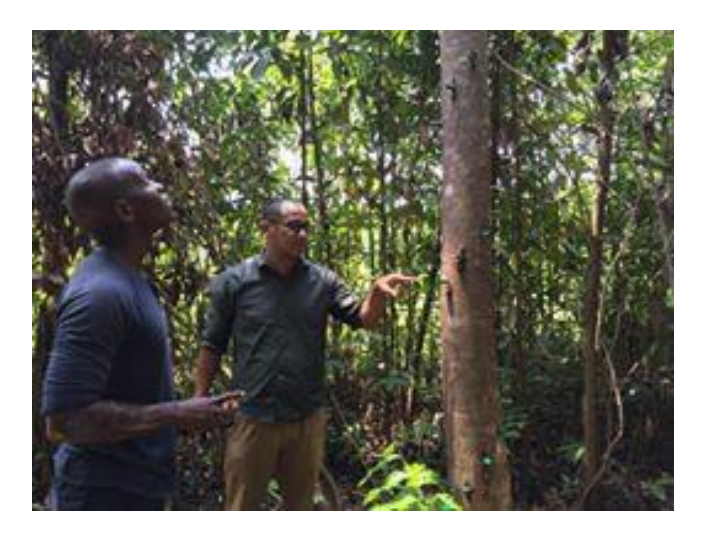
An agarwood expert inspected the treated trees

Aquilaria (agarwood) : Routine monitoring of treated trees continues, and the second round of treatment is expected to be carried out in the next reporting period.