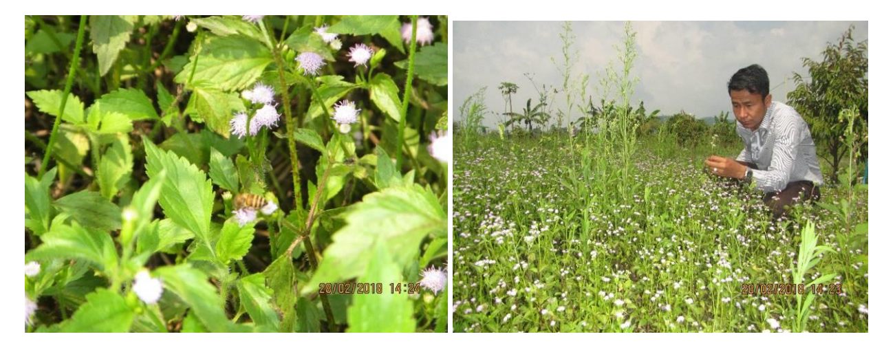
As a partner of CI, the beekeeping specialist from Save Cambodia's Wildlife (SCW) conducted a survey for potential areas for beekeeping in Koh Kong province of CCMNP

Beekeeping: An assessment of beekeeping has been undertaken with very positive results.