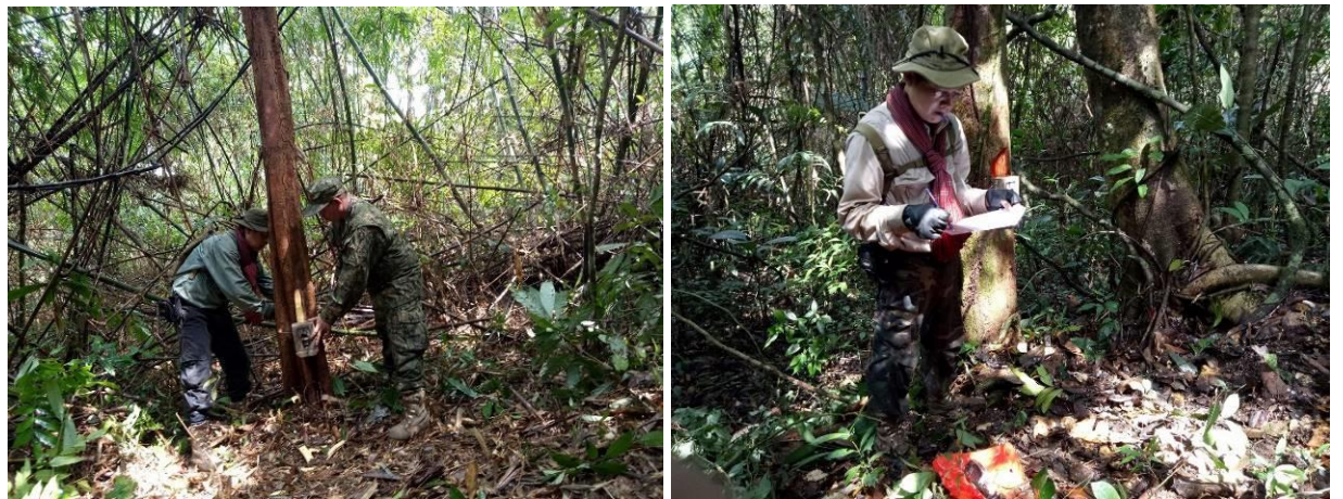
First camera trap installed in Tatay Leu commune