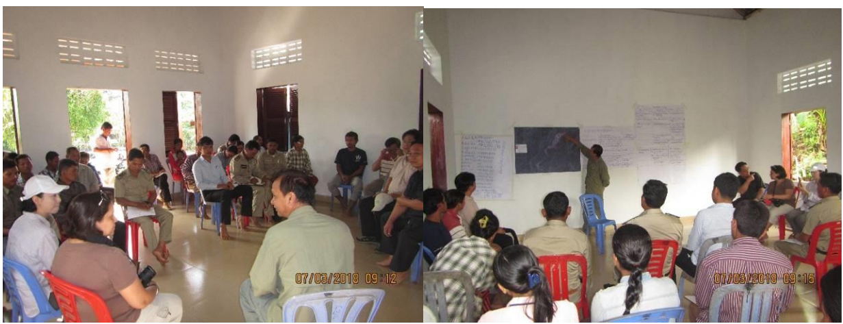
A consultation meeting on Conservation Agreement development was held in Tatay Leu commune and participated in by Koh Kong-PDoE, the Thmar Baing district officer, the Tatay Leu local authority, and the community.