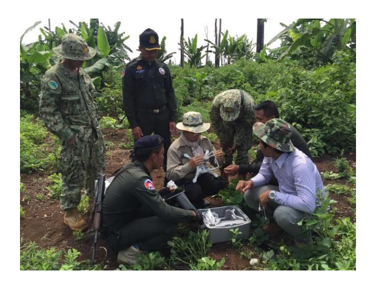
Drone being prepared for flight over O'Som commune of CCMNP