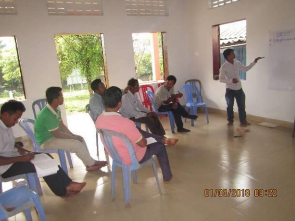
Discussion meeting on market linkages and ecotourism with Tatay Leu community