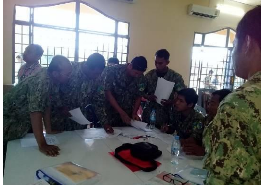
CCMNP rangers participated in a training on enforcement and the compilation of court cases