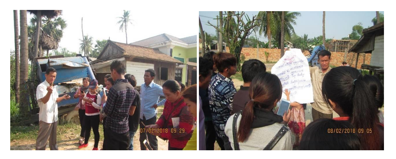
Villagers participated in a 3-day training to learn about the experience gathered through over 30 years in bat conservation and the production of farming fertilizers

Agroforestry: Tatay Leu community members made visits to a bat farm in Pursat province. For more than 30 years the bat farm has been protecting bats and making fertilizer from their guano. This activity was intended to increase community awareness of the possibilities for both income generation and soil fertility improvement from bat guano. Forty-five villagers (including 22 women) joined the trips.