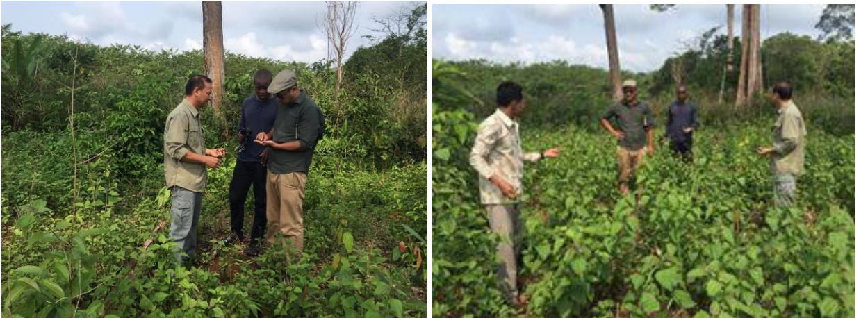
Representatives of a Phnom Penh restaurant visited and saw the potential products of communities

Lemon Grass: There was 1,600 ml of lemon grass oil produced. This has been sold to a local company, Bodia, earning the community $106.