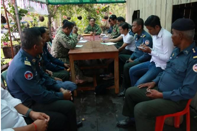
The CCMNP monthly and quarterly meetings were held at MoE and Rolek station