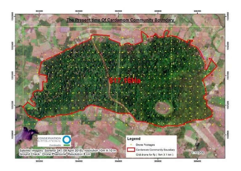
Drone image of the 517-ha area surveyed by the drone

CCMNP rangers worked to identify the extent of land grabbing and conversion in O'Som. This was achieved using satellite imagery (Sentinel 2A, resolution 10 m X 10 m), ground verification, and the use of a Phanthom4 Drone (with a resolution of 8 cm). The study covered 517.16 ha and resulted in the MoE declaring the area to be a special zone for protection.