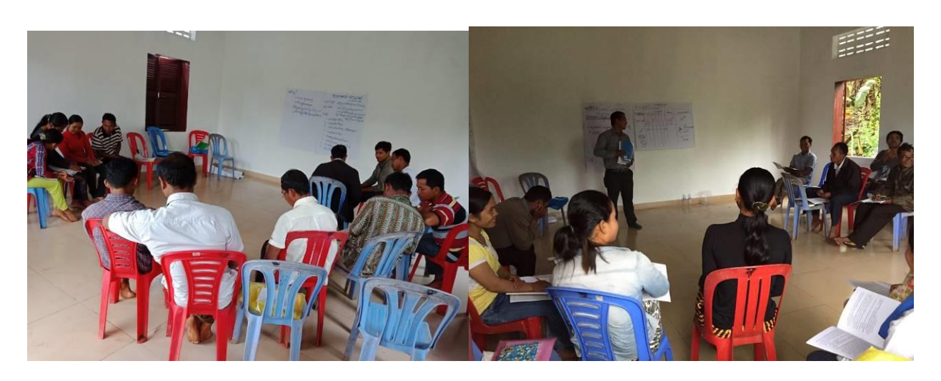
Three-day training on Women Leadership & Community Based Enterprise Development in Tatay Leu Commune