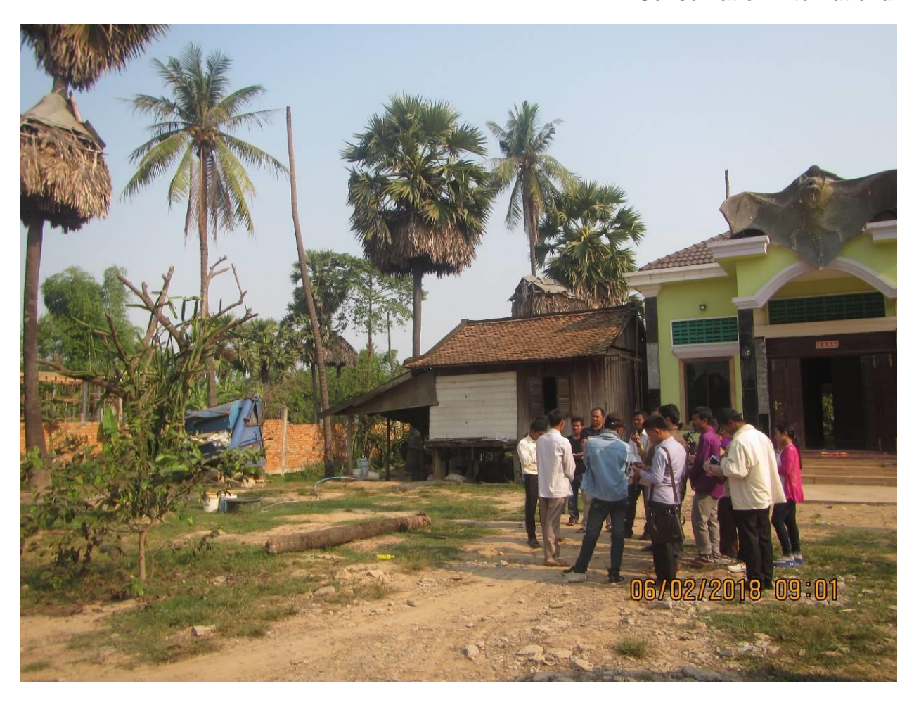
Forty-five villagers from 3 communities in Koh Kong province in CCMNP participated in a 3-day study tour to look at bat guano production and business development in Pursat province

From January to March 2018, the team supported the management of the Central Cardamoms Mountains National Park (CCMNP) through patrolling and law enforcement in collaboration with the Ministry of the Environment (MoE). In addition, they carried out biodiversity research and, through community engagement, focused on institutional development and expansion of alternative livelihood options.