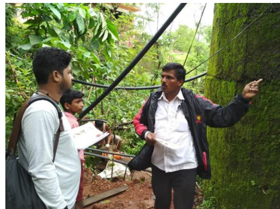
Bio-stove demonstration in Angavali; discussion with a village leader

Note: Unauthorized copying of the images and text used here is prohibited.