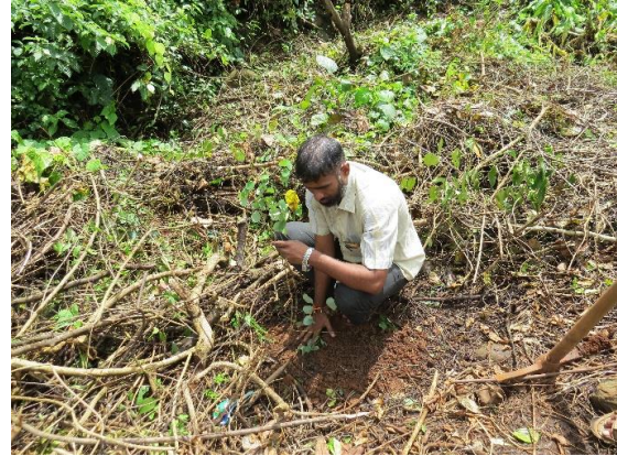
Forest restoration through planting of native saplings in the Kulye sacred grove