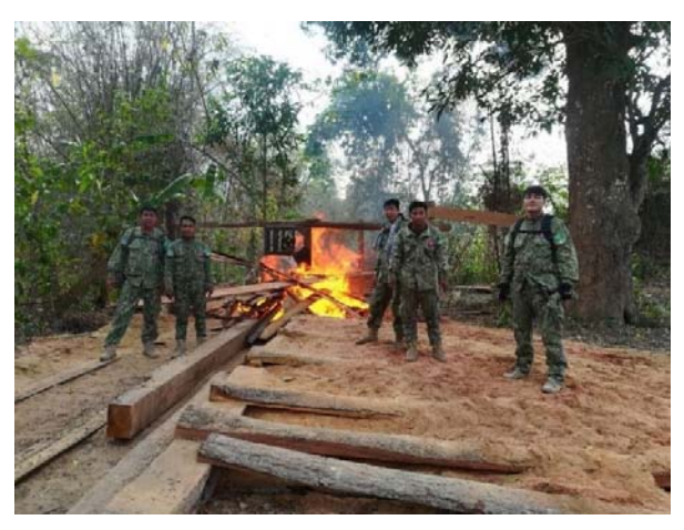
Rangers destroying illegal sawmill