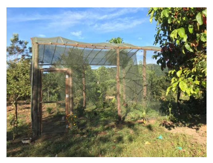
Butterfly breeding enclosure

From August 2019 to January 2020, as part of a project implemented by Cambodia's Forest Administration (FA), CI worked with the Japan International Forestry Promotion and Cooperation Center (JIFPRO) piloted a butterfly farming pilot program in Tatay Leu Commune. Butterfly farming is expected to not only provide a new source of income to villages, but also contribute to forest conservation. Five farmers took part in the training under this pilot program. Today, one of these participants continues to farm butterflies, earning income by producing and selling pupae monthly. JIFPRO will restart these activities from July 2020 with the plan to train several more farmers in butterfly farming.