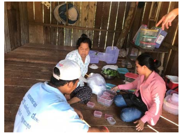
Training local farmers in butterfly farming techniques