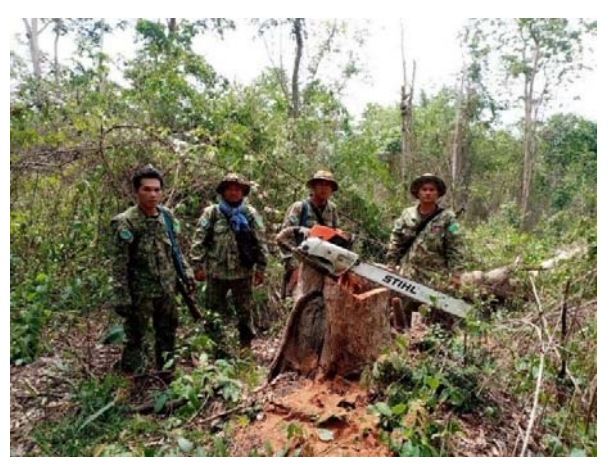
Seized chainsaws and poaching materials (bottom two)