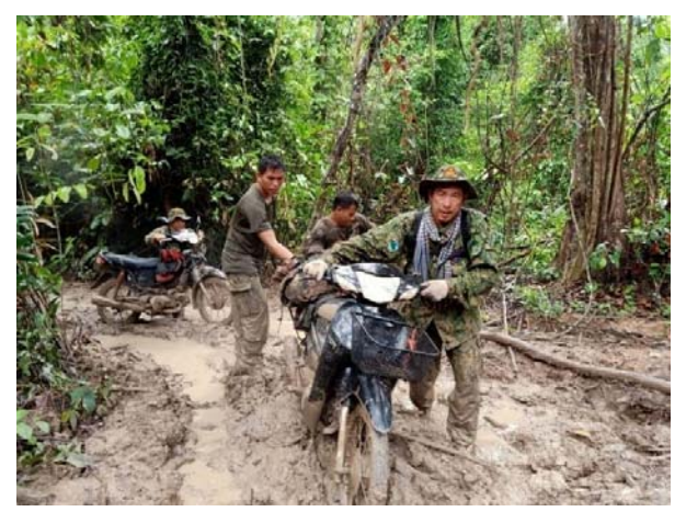
Rangers on patrol in CCMNP

From January to June 2020, the rangers conducted a total of 330 patrols, covering a distance of 17,175 km. The patrols resulted in the arrests of five individuals, seizure of 56 chainsaws and nine guns, destruction of numerous illegal hunting and logging camps, and dismantling of two large illegal sawmills. Law enforcement continues to be effective, as our monitoring has shown that the 2019 deforestation rate (0.11%) decreased slightly from 2018 (0.17%). It is still well below the national five-year average deforestation rate of 2.9% per year.