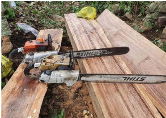
Seized chainsaws and illegally felled tree