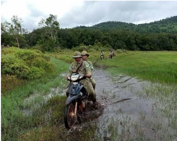
Rangers on patrol in CCMNP