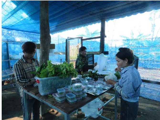
Farmers preparing eggs