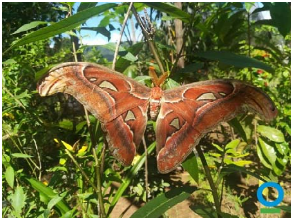
Atlas moth in the butterfly farm