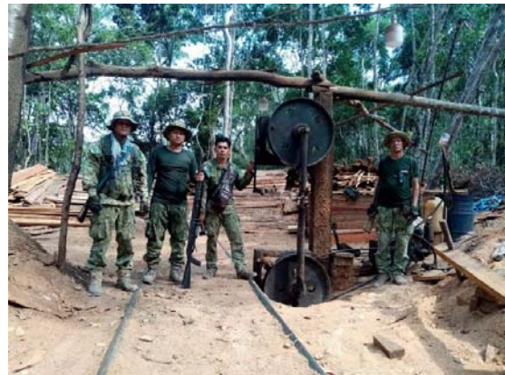
Rangers destroying illegal sawmill