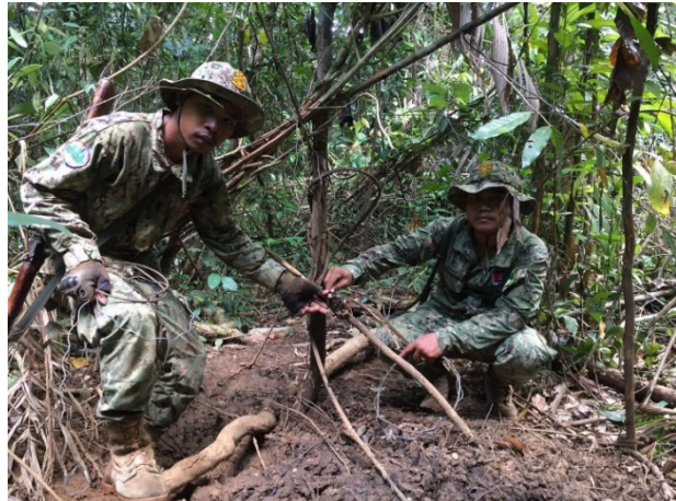
Rangers removing snares set in the forest