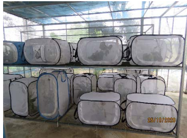
Host plants in the breeding facility