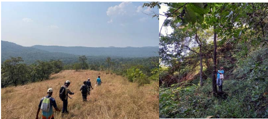
AERF team during the field work with community members in Kalambaste community forest

Summary of findings on carbon stock estimation in Kalambaste community forest from the study