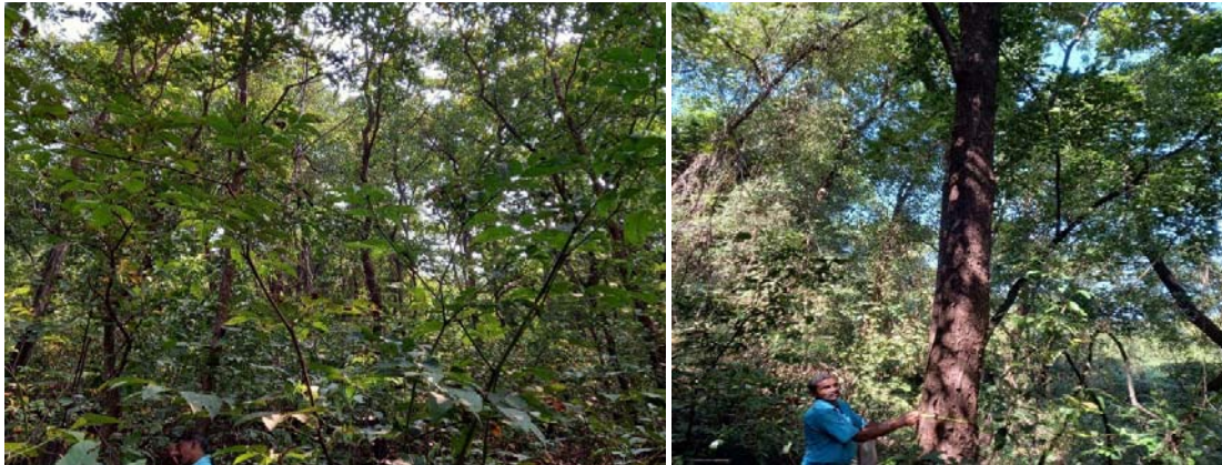
Community forest under agreement and community members engaged in carbon stock estimation