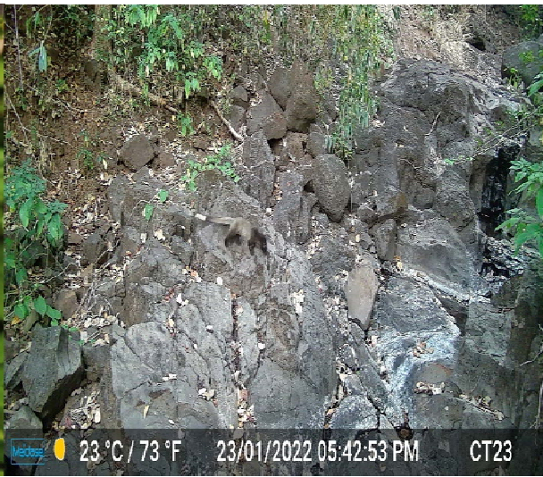
Jerdon's palm civet

Note: Unauthorized copying of the images and text used here is prohibited.