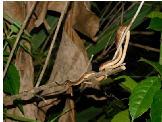
Blunt-Headed Tree Snake ( Aplopeltura boa )