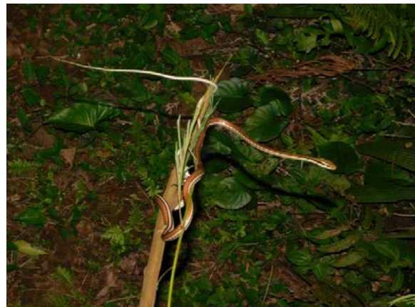
Painted Bronze-Back Snake ( Dendrelaphis pictus )