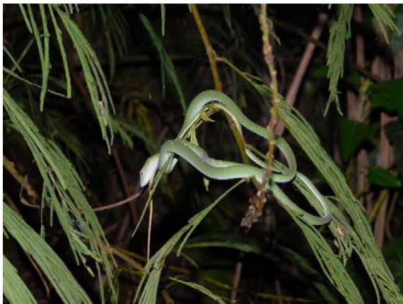
Green Vine Snake ( Ahaetulla prasina )