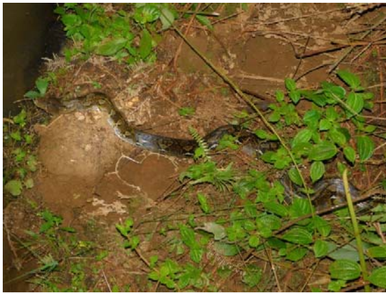
Reticulated Python ( Phyton reticulatus )

The restored forest in the Green Wall Program serves as an important habitat for wildlife in the region. Each year, CI conducts surveys on wildlife in the Green Wall area to track changes in the number and species of wildlife. In July 2022, together with park staff and local community members, we continued to take inventory of species, with a particular emphasis on snakes, through direct observations in the Green Wall forest areas. As a preliminary survey, we recorded four species of snakes. Please see pictures below for the species.