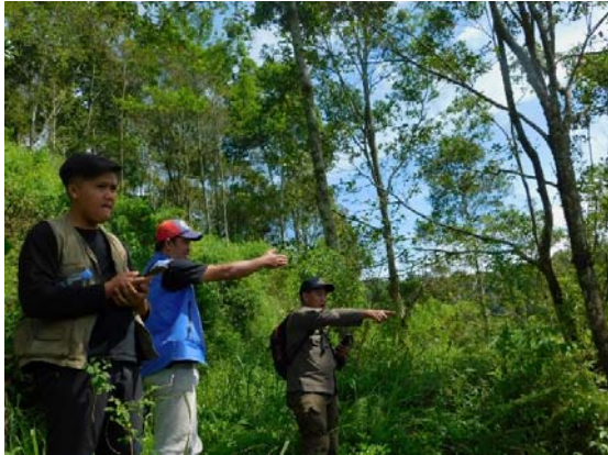
Monitoring activity in the field