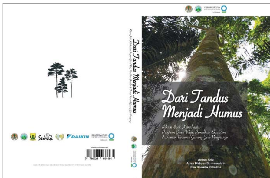
Cover of the finished guidebook

The Green Wall restoration process is a good lesson for the implementation of ecosystem restoration in conservation areas. We have documented a lengthy process for 14 years in a guidebook so that it can be used as a reference for other regions in Indonesia. In June 2022, we published a Green Wall book with the title From Barren to Humus, A Track Record of the Success of the Green Wall Program in Gunung Gede Pangrango National Park . More than 100 copies of the book were printed and distributed among the Ministry of Forestry and national parks.