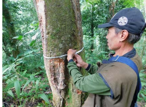
Measurement of tree diameter