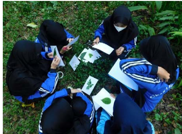
Discussion with students and practice through creating sample plots in Green Wall area