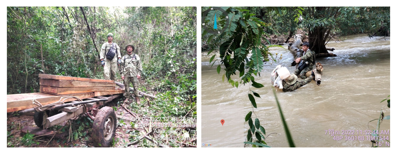
Seized illegal timber (left), and Rangers on patrol crossing a swollen river (right).