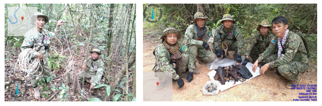
Rangers removing snares from the forest (left), and rangers confiscating bushmeat (right)

camps. Additionally, the rangers destroy any encampments that they encounter which may be used for illegal hunting.