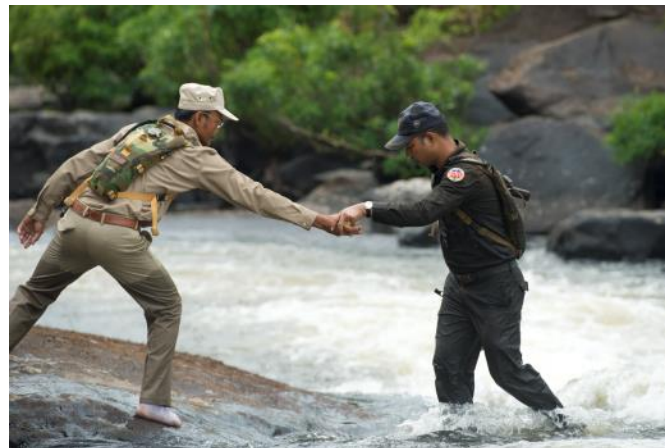
Rangers lend each other a helping hand in Thmr Bang

The CCPF/CCMNP Management team continued to meet over the reporting period. Discussions focused largely on how best to manage the situation of the transfer, how to ensure the transfer of rangers from the FA to the MoE, how to continue patrols, and how to strengthen the relationship with the MoE. Daikin support continued to make possible regular community