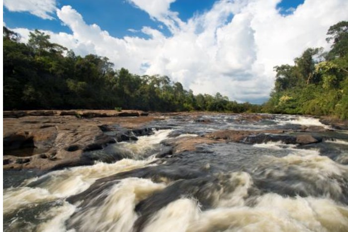
The Areng River flows through Tatai Leu in the Cardamom Mountains