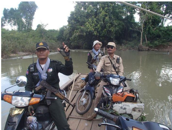
Rangers on patrol in Rolek

Despite the uncertainty over the transfer from the FA to the MoE, the rangers continued work in the CCMNP. This showed real dedication and commitment to the job because it was unclear when they would be paid and by whom.