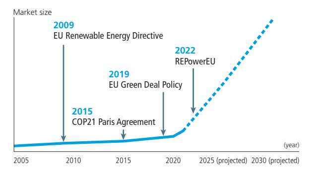
Diagram of Heat Up Heating Market Growth Influenced by European Environmental Policies

Daikin has paved the way for heat pumps to become popular by enhancing its product line up. For example, Daikin Altherma 3H HT improves the heating capacity in extremely cold regions as the only product in the industry capable of delivering hot water at high temperature without an electric heater in minus 15°C conditions. As some parts of existing combustion heating equipment can be used as they are, combustion heaters can easily be replaced by heat pumps.