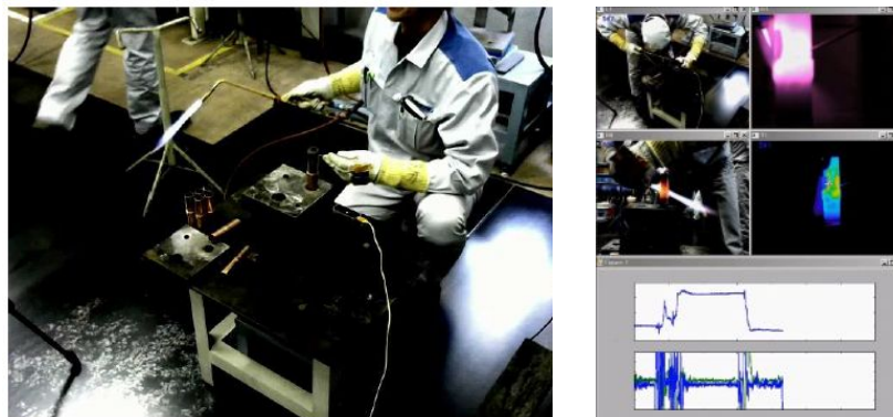
Example of brazing work and brazing process sensing, utilizing advanced image analysis

Digitalizing the Manufacturing Workplace Know-How Using Advanced Image Analysis and Other Technologies