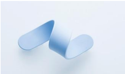
Suppleness You Want to Touch

For roughly half a century, Daikin has been utilizing the many excellent characteristics of DAI-EL , such as durability, for use in advanced industries extending even to the automobile industry. By bringing new unprecedented qualities that include amazing suppleness and eye-pleasing colors, Daikin aims to develop new applications as a material that excites the senses of touch and sight.