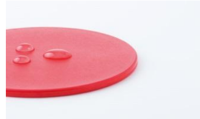
Durability That Is Sustainable