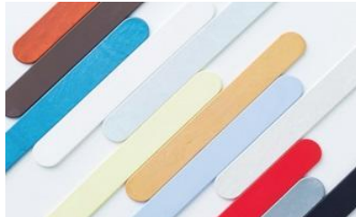
Colors That Appeal to People