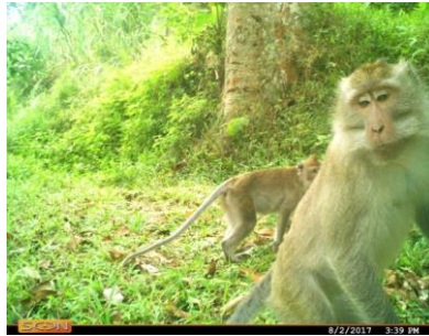
Long-tailed macaque Macaca fascicularis