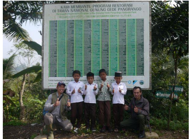
Sign Board 2