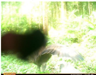
Crested serpent-eagle Spilornis cheela