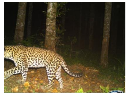
Javan leopard Panthera pardus melas