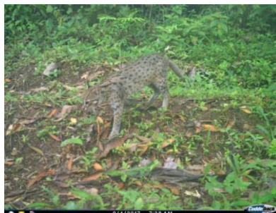
Leopard cat Prionailurus bengalensis