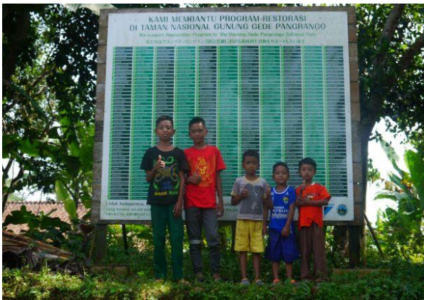
Sign board 3