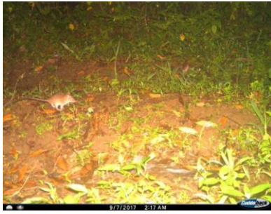
Malaysian field rat Rattus tiomanicus