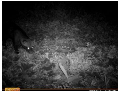
Common palm-civet Paradoxurus hermaphroditus