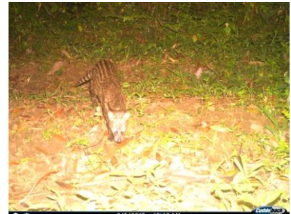
Small Indian-civet Viverricula indica