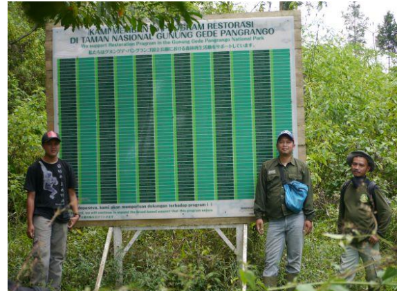
Sign board 4