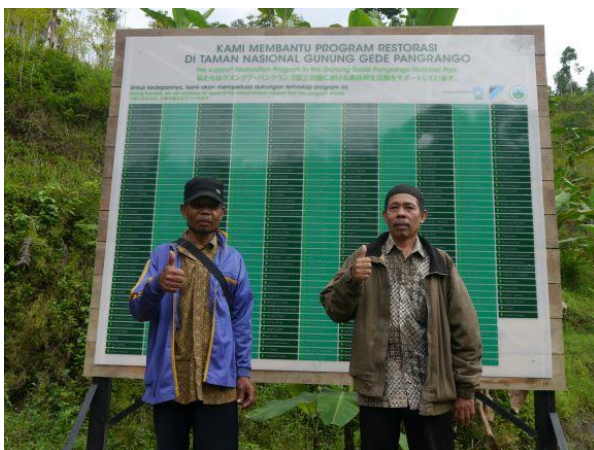
Sign board 5

Note: Unauthorized copying of the images and text used here is prohibited.