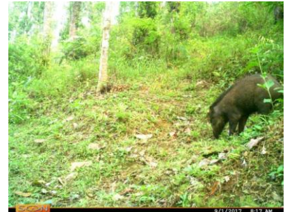
Wild boar Sus scrofa