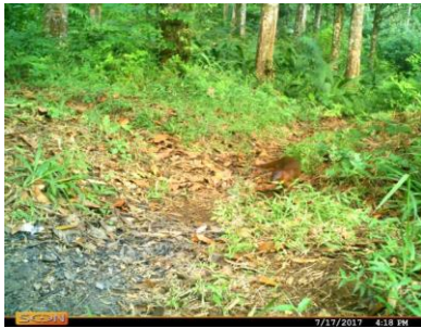
Javan gold-spotted mongoose Herpestes javanicus