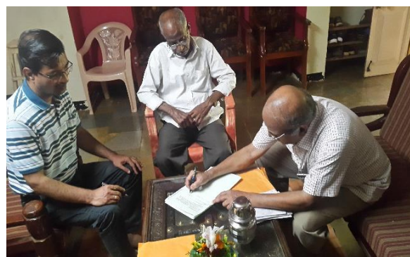
Community members from the village of Devade sign the conservation agreement