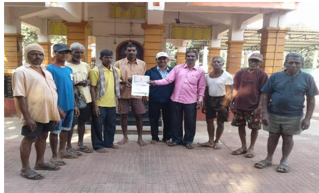
Community members sign the conservation agreement in the village of Kalamabaste