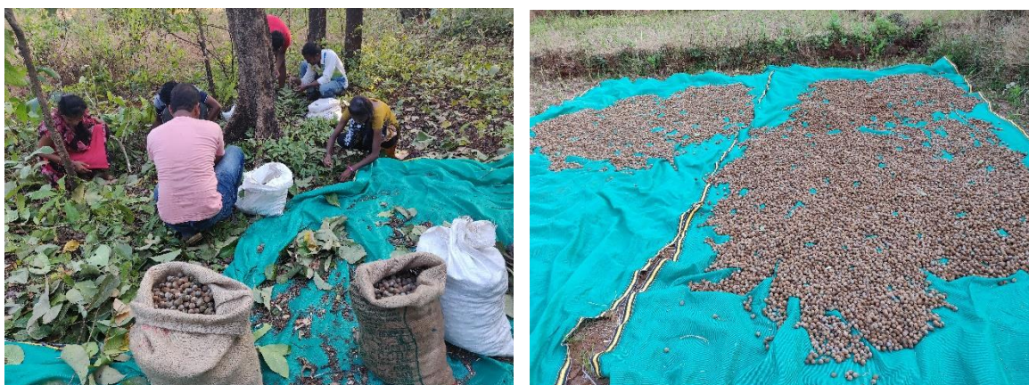
FairWild-registered collectors gather Bibhitaki husks (left), Bibhitaki fruits drying (right)

Due to sustained and committed efforts by AERF's field team over the last three years in supplying certified material to buyers, demand is growing in international markets for certified husks of Bibhitaki fruits. This has provided the necessary motivation for the collectors and will generate higher income from the collection of fruits this year. In the first two months of the harvesting season, the team already collected a total of 3200 kg of fruits from certified areas. This is an outstanding example of how enterprise mechanisms can effectively and positively impact conservation and local livelihoods.