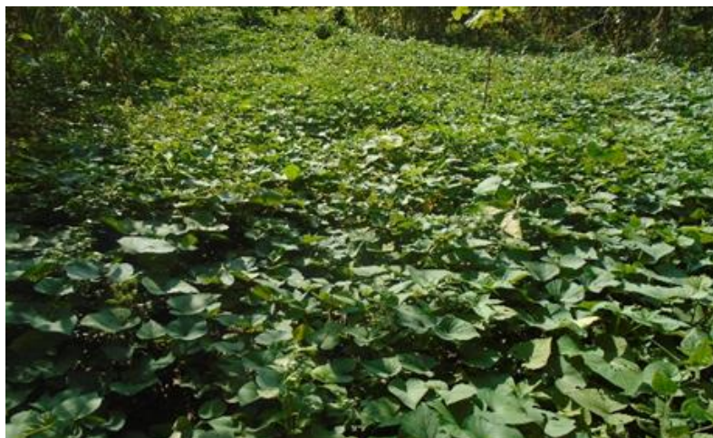
Potato field in Gbobayee