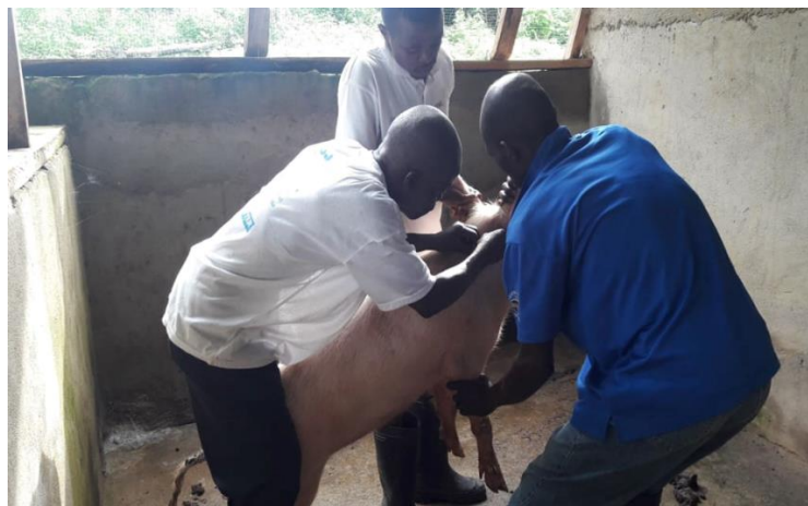
Treating a pig in Gbobayee

Furthermore, a piggery technician conducted on-site training for 26 pig caretakers. Proper feed mixture and timely feeding habits have contributed to good health and growth for the pigs.