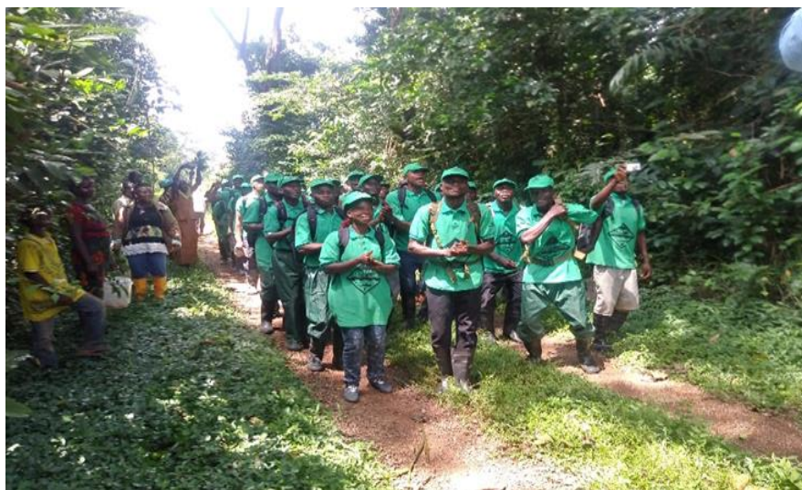
FCs embark on a joint forest patrol