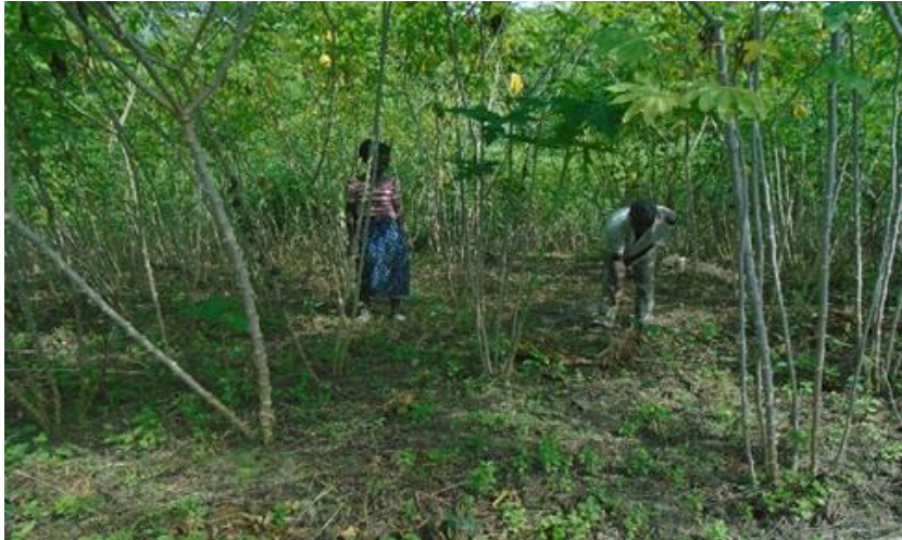
Cassava patch in Yolowee

The approximately four acres of Cassava and potato vines planted to supplement pig feed have matured and are now being used to feed the pigs. The papaya, however, will take a little more time until it is ready.