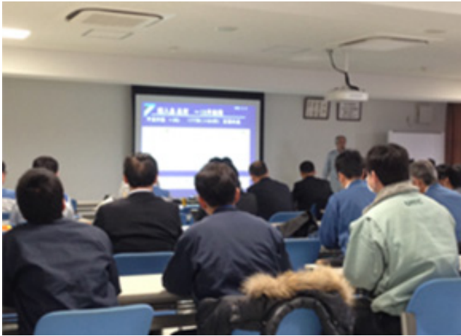
Quality improvement announcement meeting