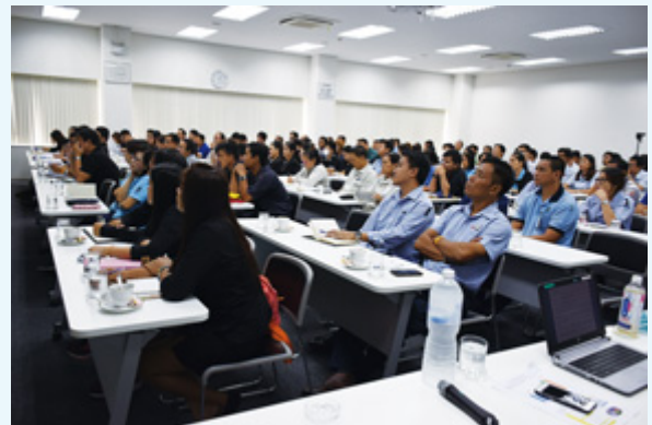
Quality control training session for suppliers

Also in fiscal 2017, executive management members visited suppliers to conduct quality patrols to inspect progress in quality improvement efforts.