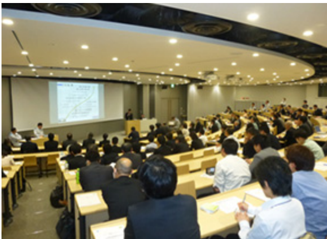
Quality Forum sponsored by the Chemicals Division

In the Chemicals Division, besides the ongoing Quality Forum meetings, purchasing managers keep in close contact with suppliers to gather and exchange information in areas such as technology, quality, and prices. Any problems that come up are solved through extraordinary or emergency support requests to relevant divisions.