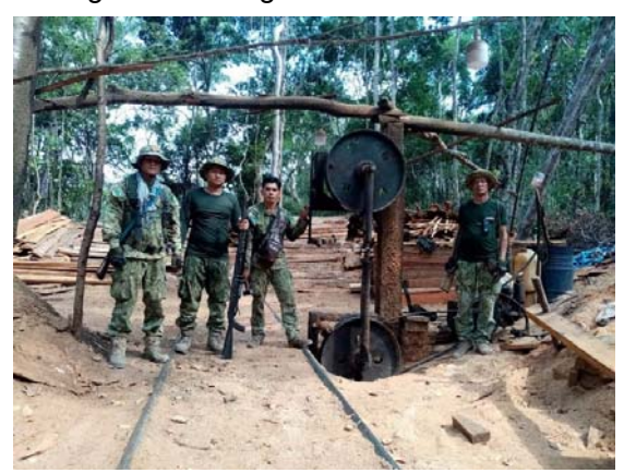
Rangers destroying illegal sawmill