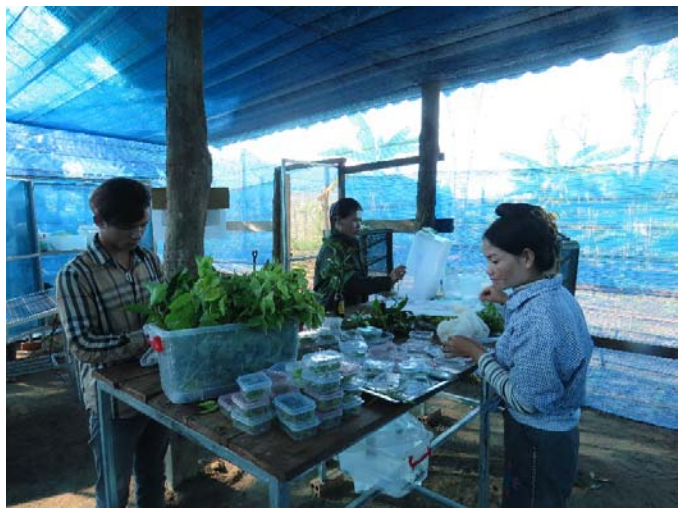
Farmers preparing eggs