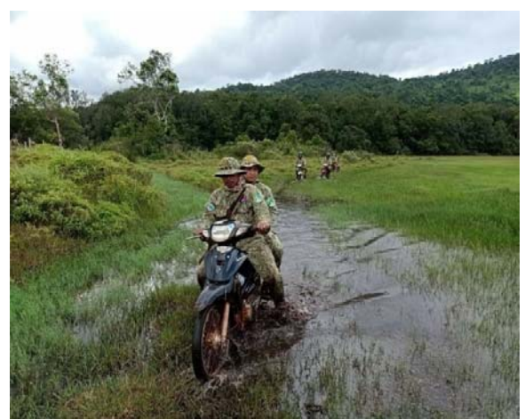
Rangers on patrol in CCMNP