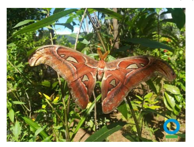
Atlas moth in the butterfly farm