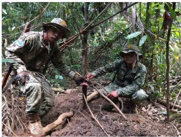
Rangers removing snares set in the forest