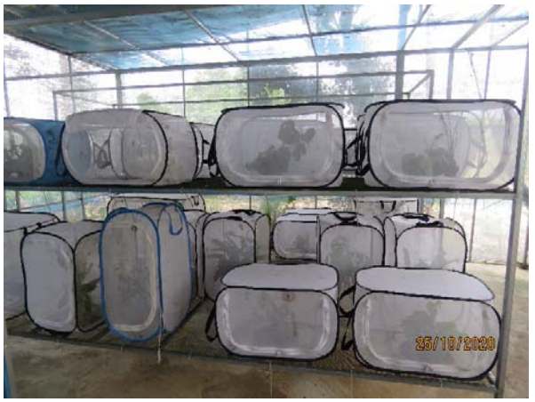
Host plants in the breeding facility