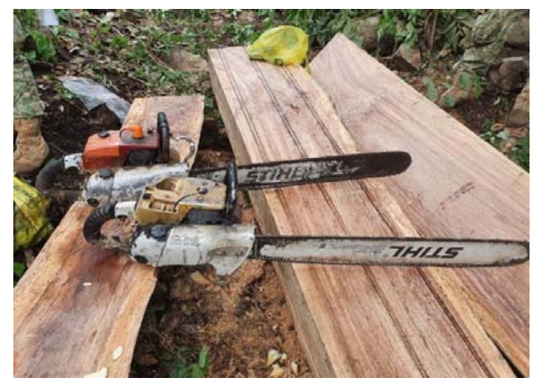
Seized chainsaws and illegally felled tree