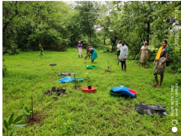
Community members from Kalambaste and Katavali villages during reforestation activities.