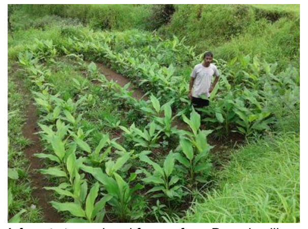
A forest steward and farmer from Devade village

The areas around the forests under conservation agreements have faced the problem of crop damages due to wild animals. Turmeric is disliked by the main perpetrators of Indian gaur and wild boar, providing a solution that balances both conservation and farming.