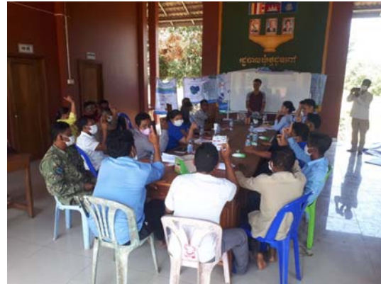
Suggestion box used as part of the Grievance Mechanism (left), Briefing on the suggestion box given to community members (right)