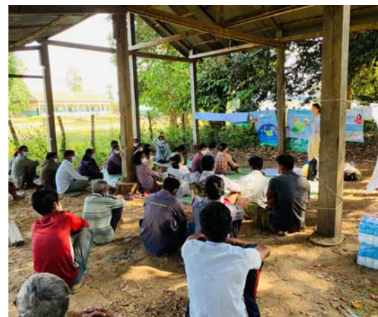
Community briefings as part of the process of REDD+ Free Prior Informed Consent (FPIC)