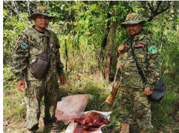
Rangers on patrol (left), Rangers confiscating bushmeat (right)