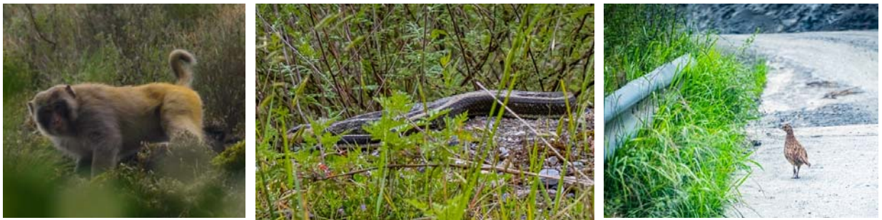
Wildlife sighting at Ganpu project site (left to right: Rhesus monkey, striped fish, Japanese pheasant)

Note: Unauthorized copying of the images and text used here is prohibited.