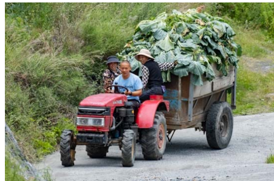
Harvesting cabbage (left), Fresh vegetables also serve as pig feed in Tibet (right)