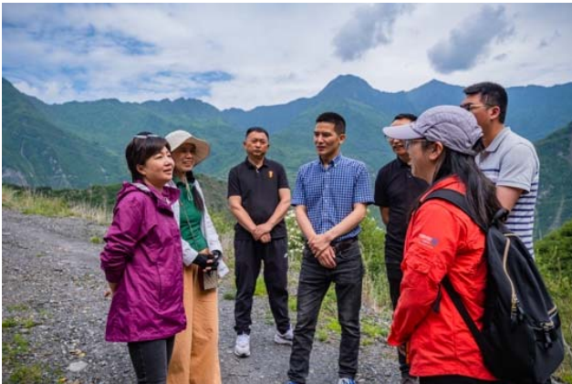
Partners meeting at Ganpu project site