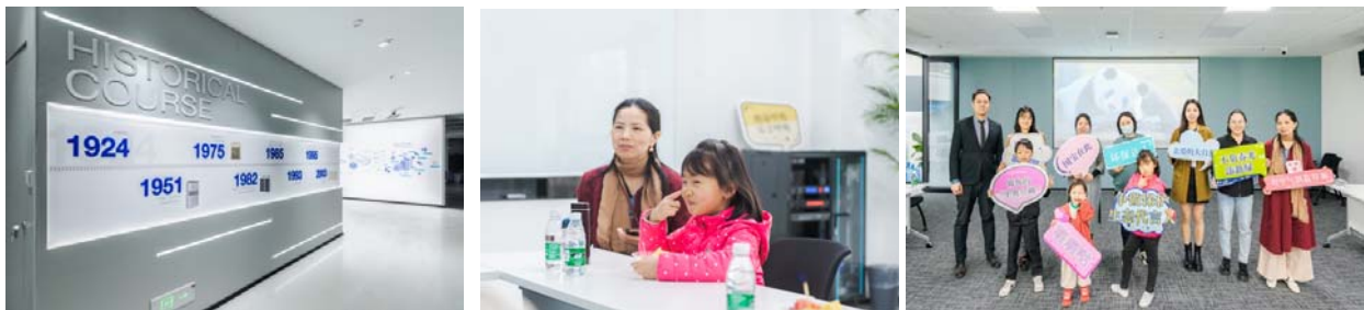
Education course on giant pandas held at Daikin Chengdu Experience Store

On March 27, 2022, Daikin China and CI China jointly hosted a family-oriented learning course on giant pandas at Daikin's new Experience Store in Chengdu. At the invitation of CI, an expert on giant pandas taught the participating families about the giant panda's evolution, their food, neighbors, habitats, and how people can protect giant pandas in their daily life. At the end of the course, participants received a gift of giant panda merchandise. Following the course, the Daikin Chengdu Experience Store staff gave a presentation on Daikin and its air conditioners.