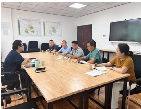
Meeting with other environmental NGOs