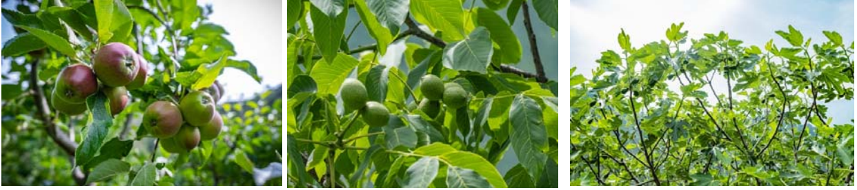
Apple, fig, and walnut trees maturing and bearing fruit