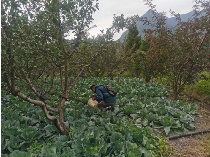
7. Expert collecting soil samples