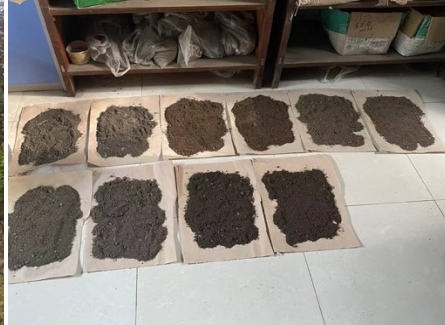
8. Drying soil samples