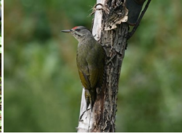
2. Grey-headed woodpecker ( Picus canus )