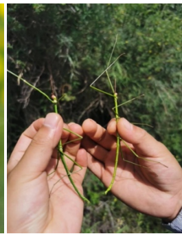
5. Stick insect