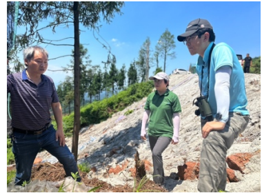
15. CI China staff talk with local partner in Hongya County

Note: Unauthorized copying of the images and text used here is prohibited.