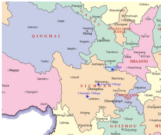
The three sites where research was conducted

In February 2023, CI China collaborated with forest ecology and forest sustainable management experts from the Chinese Academy of Science to launch a case study on successful collective forest management in southwestern China (Sichuan and Gansu provinces) based on our demonstration in Ganpu Village, Lixian County for villagers.