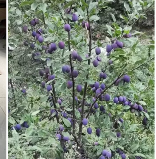
9. Prune fruit at project site