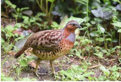
1. Chinese Bamboo Partridge ( bambusicola thoracica )