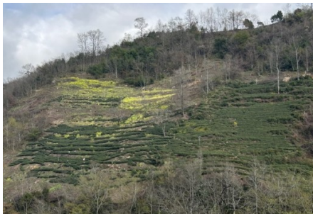
10. Liziba Village's community forest— tea mountain