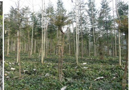
12. Lianhe Village's Coptis chinensis (traditional Chinese Herb) planted under trees