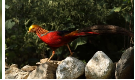
3. Golden Pheasant ( Chrysolophus pictus )