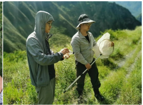
6. Insect monitoring