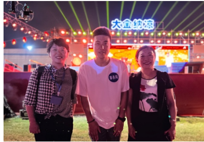
14. Representatives from CI, Daikin, and YGE