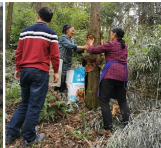
11. Changfu Village, Dendrobium officinale (traditional Chinese herb) tied on trees to grow