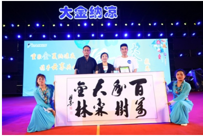
13. Launch Daikin China staff launching the tree planting project