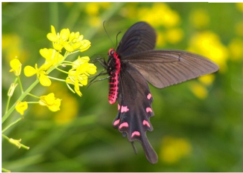
4. Byasa Menciuis (a species of butterfly)