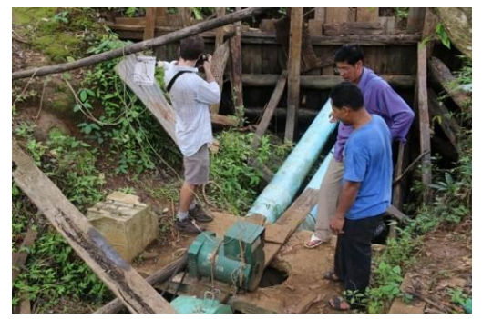
Researcher studying the micro-hydro unit, Tatai Leu