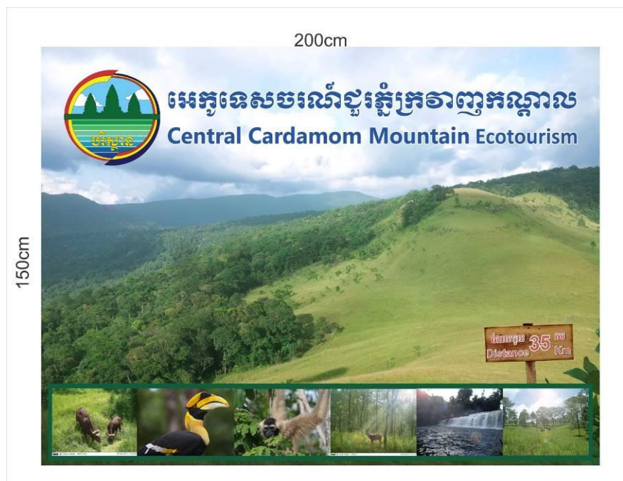
Example of sign board for Tatai Leu eco-tourism