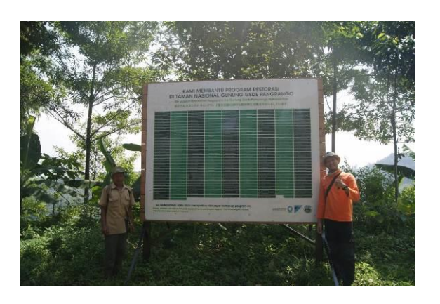
Sign board 4 (July–September 2016)