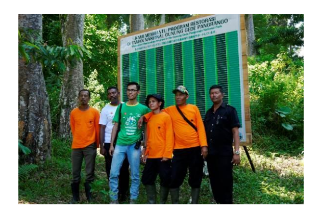
Sign board 1 (July–September 2016)

There are four Daikin sign boards at the project site. These sign boards are monitored on a monthly basis and currently are in good condition.