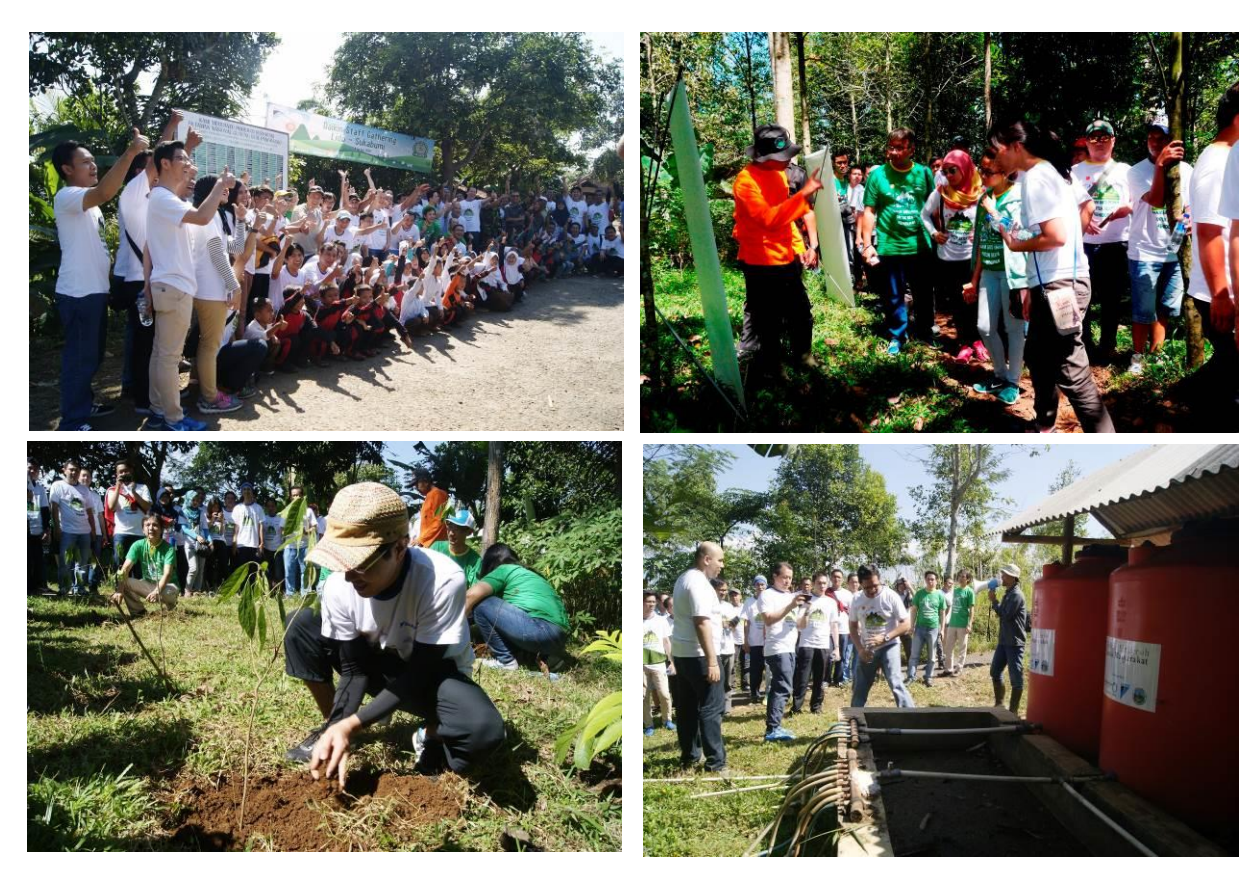
Daikin Indonesia employees visit the Green Wall Project Site