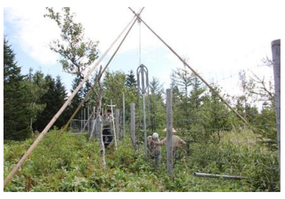
Installing metal fence posts (September)

From Friday, September 24th to Sunday, September 26th, Daikin Shiretoko volunteer activities were conducted for the eleventh time. Eleven volunteers repaired deer fences damaged by summer typhoons and bark protection nets inside the fences. They also helped with various forestation efforts, including weeding in seedling plots.