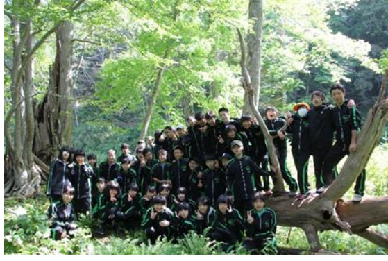
First year students from Shari Junior High School visiting the 100 square meter work area pose for a photo on a large Japanese Judas tree (September)

Summer is a season when weeds grow fast. When weeds grow into electrified fences that prevent bears from entering populated areas, electricity is lost and the efficacy of the fence is reduced. Once every 1–2 weeks, voltage checks are made on electrified fences, and in August, mowing was conducted throughout the entire area.