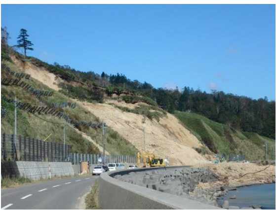
Electric fences destroyed by landslide