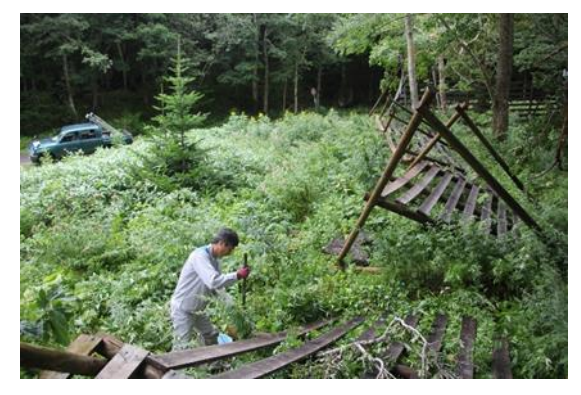
Broken deer fences (August)

From Friday, September 24th to Sunday, September 26th, Daikin Shiretoko volunteer activities were conducted for the eleventh time. Eleven volunteers repaired deer fences damaged by summer typhoons and bark protection nets inside the fences. They also helped with various forestation efforts, including weeding in seedling plots.