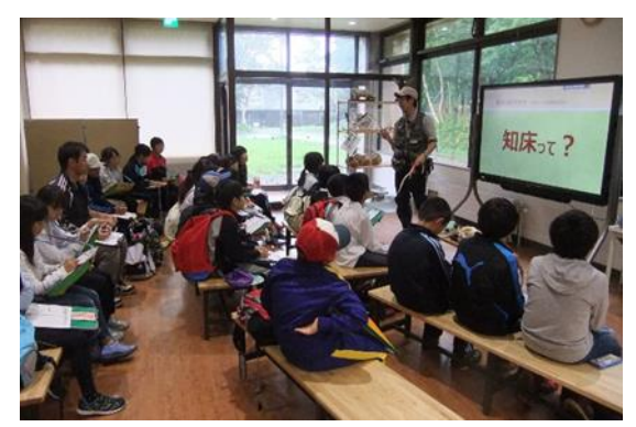
Lecture for Abashiri Chuo Elementary School students (August)

In addition to regularly conducting lectures on Shiretoko's nature, history, forestation activities and their importance at the Shiretoko National Park Nature Center, we also conducted lectures and interactive learning activities for eight groups of local elementary, high school and college students totaling 284 people.