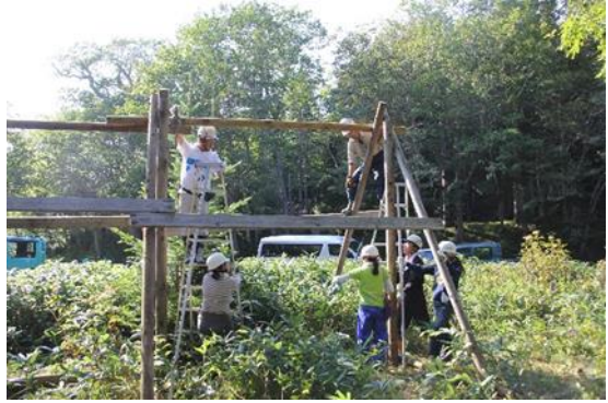
Daikin volunteers doing repair work (September)