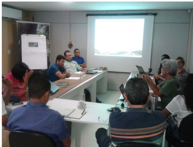
At the June 16 meeting on community-based forest management

On June 16, there was a meeting in Belém, Pará State, attended by representatives from government, the private sector, and research institutes. Participants held technical discussions on strategies aimed at creating networks and ways to strengthen forest management. A follow-up meeting will be held in August to continue discussions.