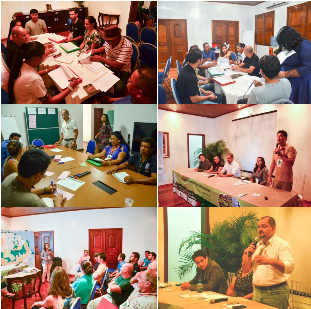
Some of the discussion meetings held at SAPEG

policies and communication strategies. They also discussed conservation of water resources and endemic species, maintenance of forests, clarification of the value of traditional knowledge and culture, and strengthening of sustainable production chains.