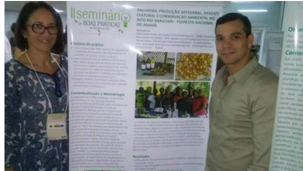
Bom Sucesso Association members with their presentation material at the seminar

was about making handmade products using materials from trees such as andiroba ( Carapa guianensis Aubl.), copaiba ( Copaifera dukei Dwyer), fava ( Parkia spp.), and breu ( Protium sp.).