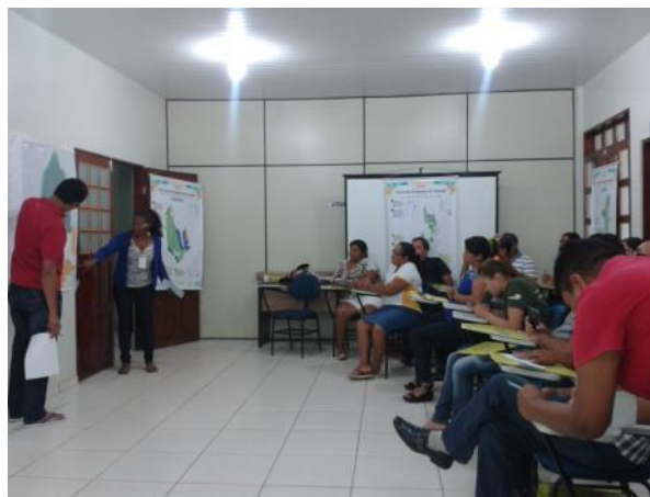
Workshop to facilitate the formulation of the Communication Plan; held in the municipality of Ferreira Gomes

We are currently formulating the Communication Plan of the protected areas of Amapá, which we aim to have completed by May. From March 11 to 13, we held a plan-formulation workshop in Ferreira Gomes, which was attended by 25 community leaders from four cities. The workshop aimed to identify the strategic elements needed to support the Communication Plan.