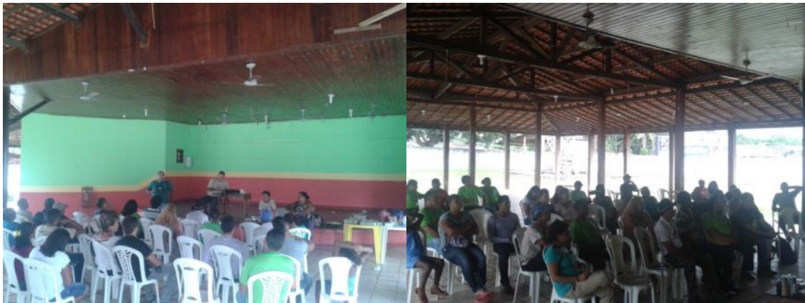
Meeting of the Bom Secesso Association

One of the local organizations in which residents of Amapá State Forest (FLOTA) and Amapá National Forest (FLONA) participate is the Association of Agroextractive Producers Bordering the Araguari River (Bom Sucesso). The Association meeting was held in the city of Porto Grande (Amapá) on February 19. The 35 community members at the meeting discussed non-timber forest products (NTFP) management projects and agroecology-based sustainable production, shared experiences in the Tapajós National Forest, strengthened the social organization along the Araguari River, and created the association's logo.