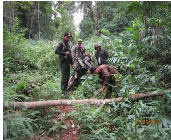
Scenes of patrols; confiscated wood