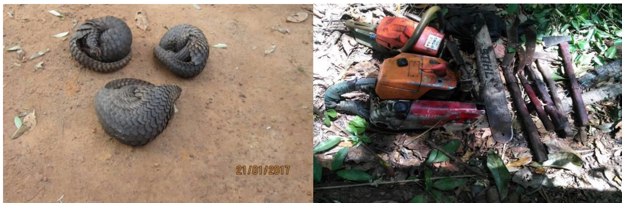
Confiscated items: pangolins (a type of anteater) and chainsaws

Patrols this reporting period yielded many successes. As a result of conducting patrols 179 times and surprise inspections 62 times, 48 chainsaws were confiscated and their owners charged in local courts of law. Also confiscated were 48 plastic bag traps and seven rope traps.