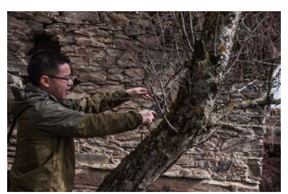
Removing young cypress tree branches

In late March, the local Environmental Protection and Forestry Bureau, our partner in this project, tended to the saplings in the collectively owned forests in Ganpu village. About 20 villagers removed the lower branches of the saplings and tended to the young cypress trees to help them grow better. They also planted saplings in areas that had been damaged by goats.