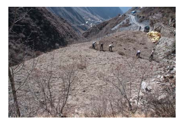
Clearing the land in preparation for agroforestry