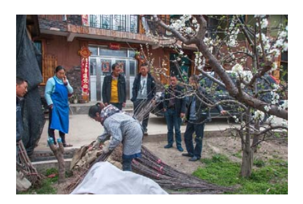
Purchasing apple saplings