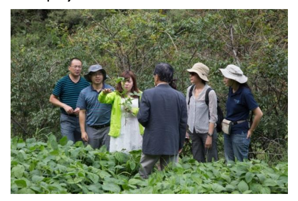
Visiting the agro-forestry demonstration area

After the ceremony, representatives from Daikin, CI and the local government visited the agroforestry demonstration field and set up a project signboard. There, CI project staff introduced the concept and progress of the project.