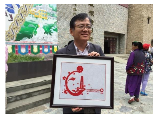
The paper-cutting work gift