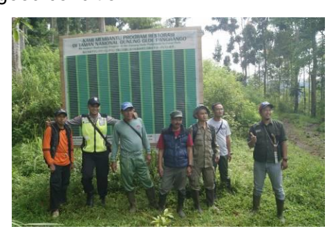
Signboard 1 (Jan.-Mar. 2017)

There are currently five signboards on the site. The most recent monitoring showed them to be in good condition.