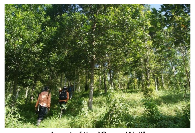
A part of the "Green Wall"