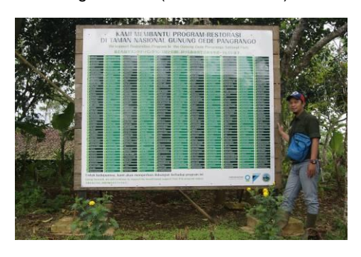
Signboard 3 (Jan.-Mar. 2017)