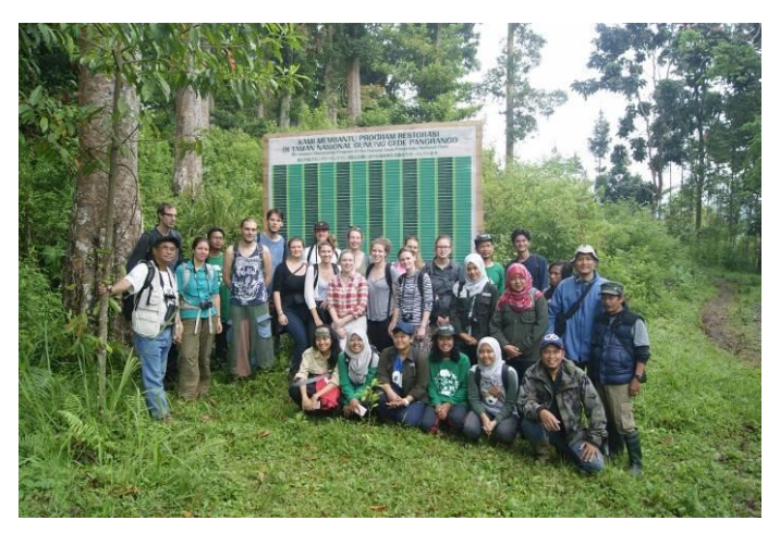
Leiden University students and Indonesian university students at the project site

In January 2017, students from Leiden University in the Netherlands visited the project site. Together with Indonesian university students who had studied the Green Wall, they formed a group of 23 students who toured various parts of the site.