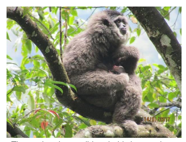
The mother Javan gibbon holds her newborn

On January 14, one of the Javan gibbons we had rehabilitated and returned to the wild gave birth! This is the first time in this region that a baby Javan gibbon has ever been born of parents returned to the wild. Happening just nine months after the gibbons were returned to their natural habitat, this remarkable achievement shows the success of the rehabilitation program.