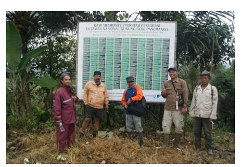
Signboard 2 (Jan.-March 2017)