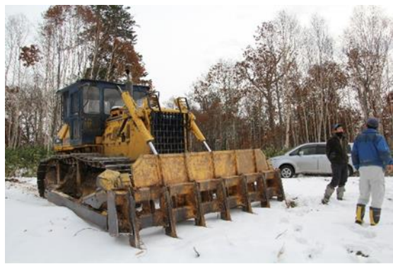
Equipment used to remove bamboo grass (October)