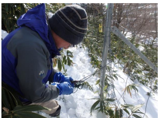
Removing an electrified fence