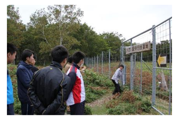
Shari High School students see the deer fence (October)

A tour of the 100-m2 Movement Trust Area was held for 15 third-year students of Shari High School. Daikin also held lectures and learning activities at the Shiretoko National Park Nature Center so as to teach the many visitors to Shiretoko about the area's nature, history, and the 100-m2 Movement Trust Area.