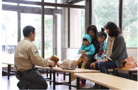
A lecture at the Shiretoko National Park Nature Center (September)