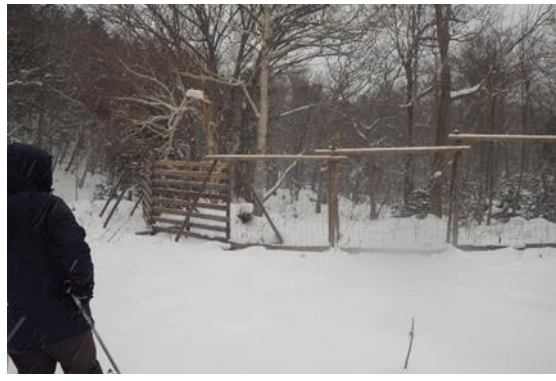
Inspecting the deer fence along the Iwaobetsu River (December)

In order to study ways to rejuvenate the forest and create a work plan, a visit was made to the Uryu Experimental Forest of Hokkaido University in order to gather information on stateof-the-art case studies. Participants observed activities such as the removal of bamboo grass.