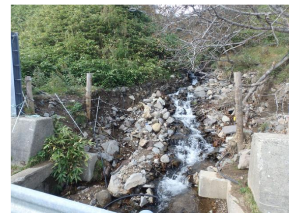
Electrified fence damaged by a landslide

Snow began to fall in November, and bear sightings became quite rare, so fence removal work was carried out in late November in the remaining areas before the snow got too deep. The fence removal work involves removing the electrical lines from the posts and binding them together on the ground with string so they don't blow away in the driving snow. The fiberglass poles are removed and bound so that they do not bend from the weight of the snow sliding down the slope. In this way, preparations were able to be made for the installation of new fences in the spring.