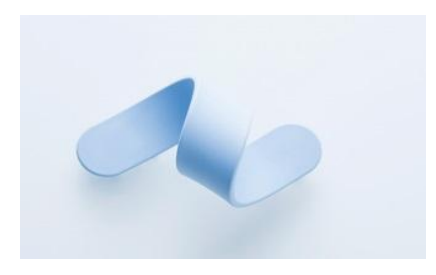
Suppleness You Want to Touch

For roughly half a century, Daikin has been utilizing the many excellent characteristics of DAI-EL , such as durability, for use in advanced industries extending even to the automobile industry. By bringing new unprecedented qualities that include amazing suppleness and eye-pleasing colors, Daikin aims to develop new applications as a material that excites the senses of touch and sight.